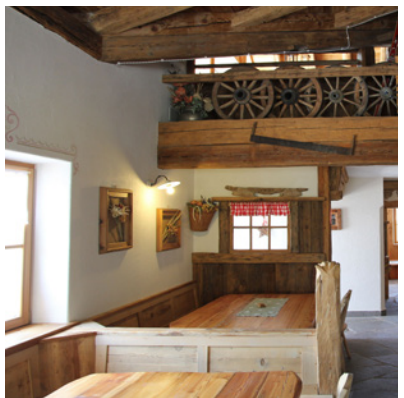
Rifugio Baita Paradiso